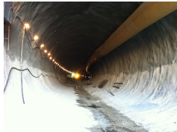
Fig. 2. Tunnel 220 m long driven by SEM