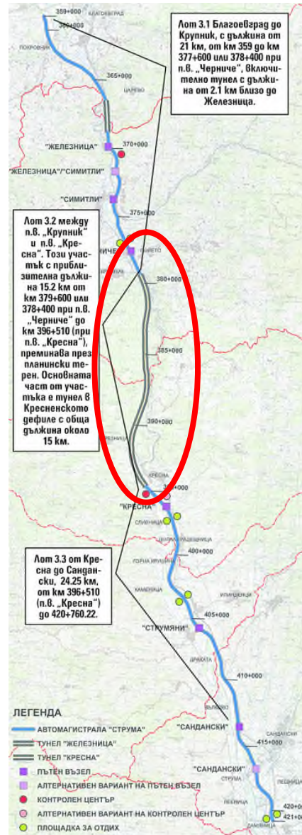
Fig. 3. Struma motorway – Lot 3. Long twin-tunnel (in closed area)

The next stage of work is completion of the actual conceptual design, which will happen in the first half of 2014. This will make possible to start tender procedures for construction of road sections and at later stage – tunnel itself. Another shorter twin-tunnel having length 2.6 km is foreseen to be carried out close to the longer one.